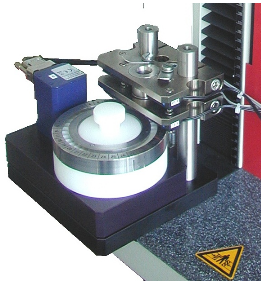
Liquid collecting station