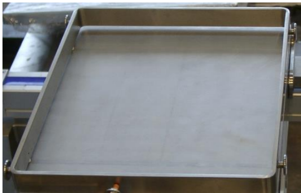
Frames are stored in a magazine