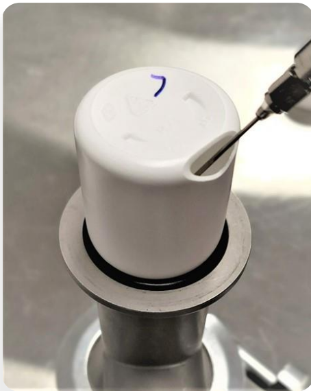
Induction Seal Vacuum Fixture