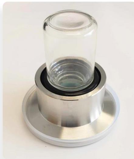
Plastic Vial Fixture (test ready)