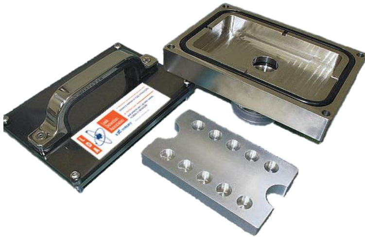
Rectangular Chambers Blistercards/Pouches