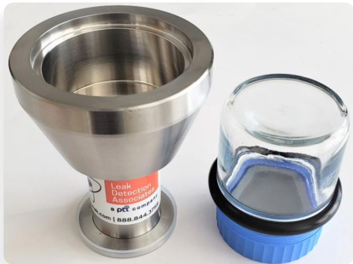
Glass Jar – Closure Fixture