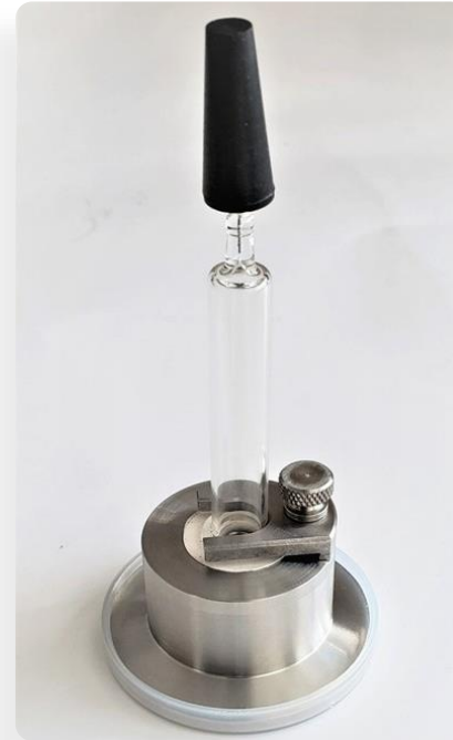
Syringe Barrel Needle Fuse Leak Test Fixture