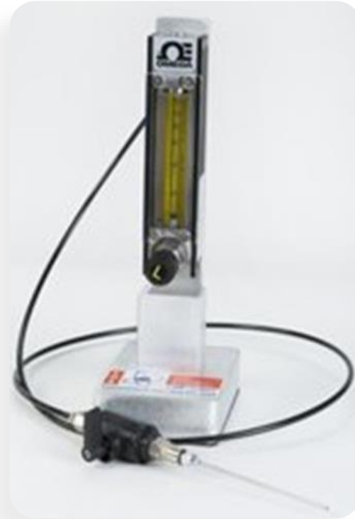
Helium Flow Meter