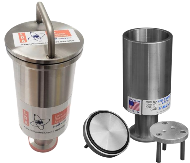
Cylindrical Chambers Vials