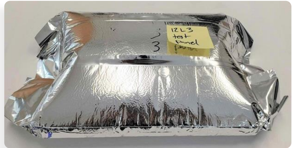
Foil Bag Sniff Leak Test