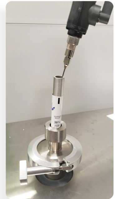
Foil Tube - Closure Leak Test Fixture