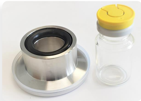
Plastic Vial Test Fixture