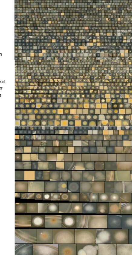
Figure 2. Colonial variation used for AI model training

Figure 1. Scientific provenance of developing proven and robust AI tools for analysis