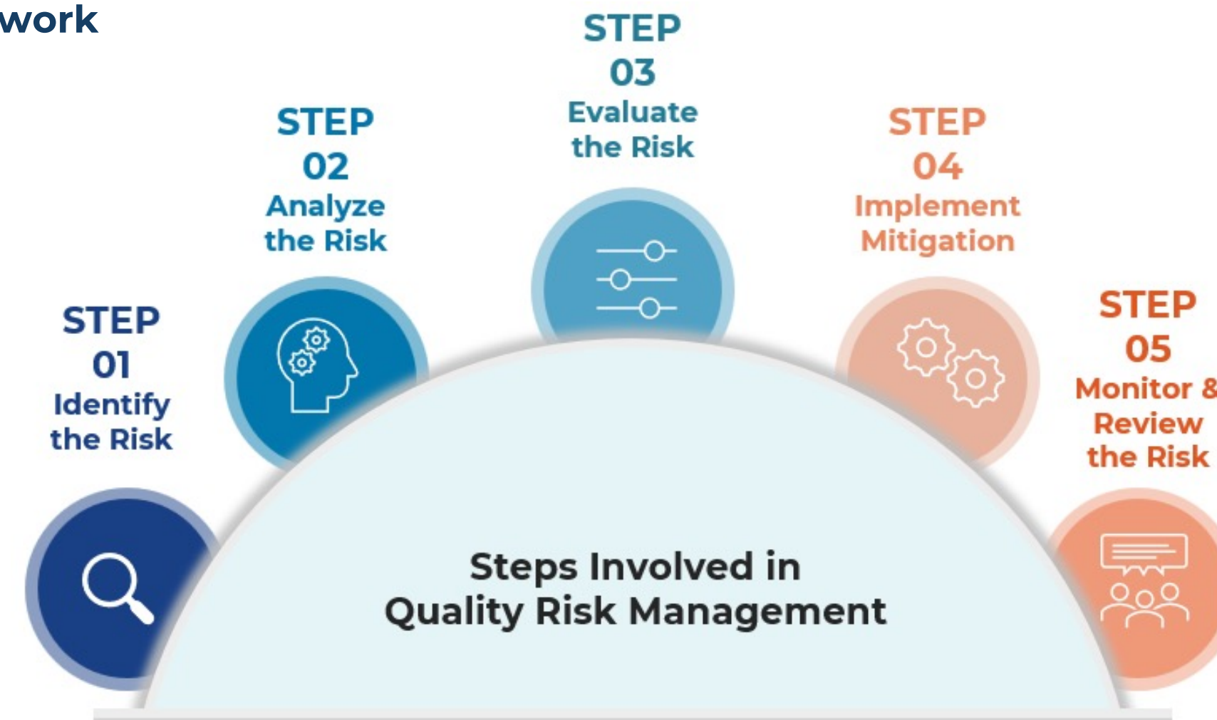
Figure 2. The five steps involved in QRM.