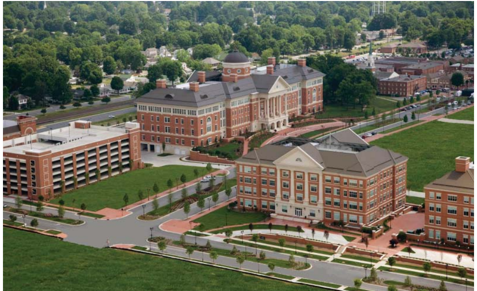
The 350-acre research campus, located near Charlotte in Kannapolis, North Carolina, opened its doors in October 2008.