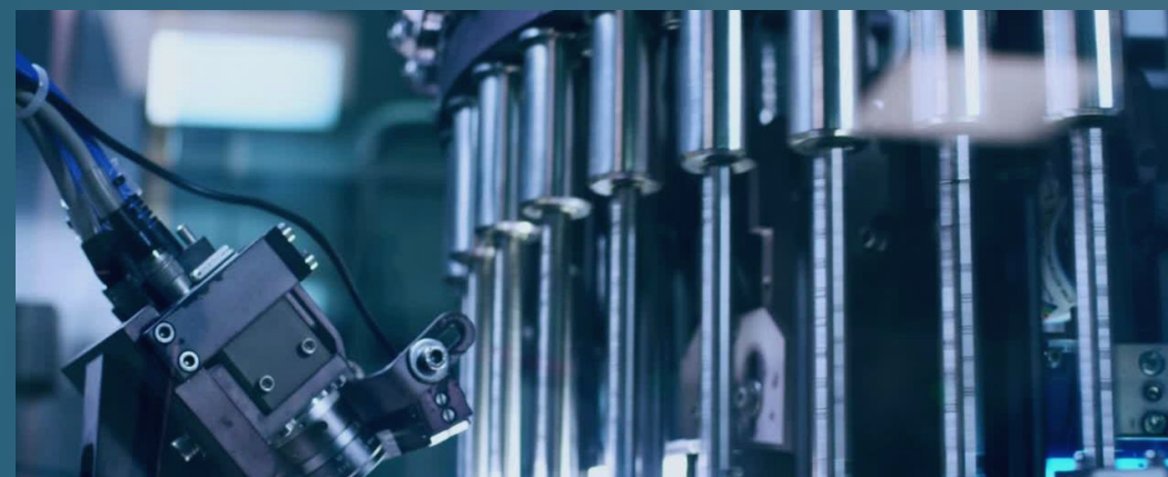
TRAINING AND RESEARCH INSTITUTE (TRI)